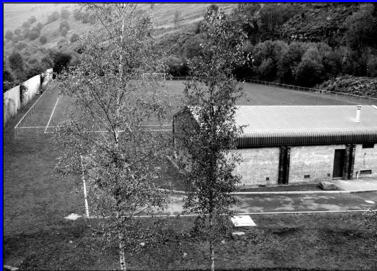
The site of the former Power Station 2007

The now demolished Ebenezer Chapel is the three story building seen in the top left hand of the picture, now the site of Ashfield House, a local authority run centre for the development of young people. This is where the first rehearsals of the new choir took place.