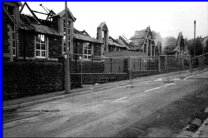
Tylorstown Primary School after the devastating fire June 2000